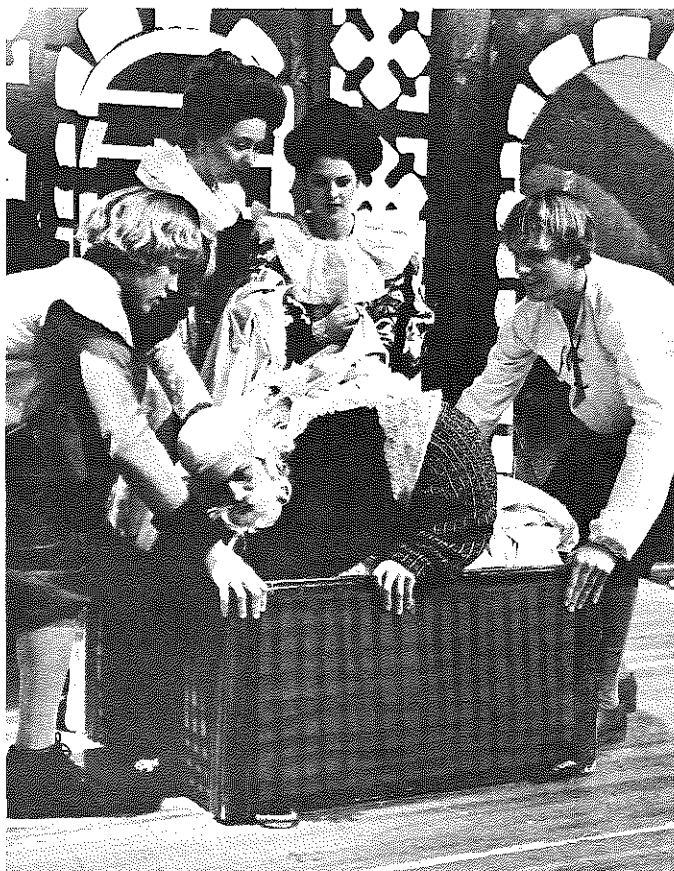
Luxemburg-Casco's WHSFA Drama Contest entry was a cutting from "The Merry Wives of Windsor!"