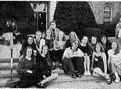
Rio High School

PRESORTED STANDARD NON PROFIT PERMIT NO. 14 EVANSVILLE, WI 53536