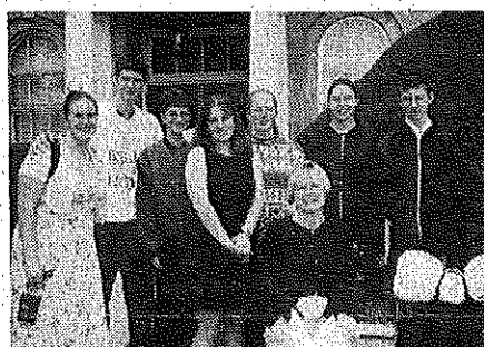
Park Falls High School