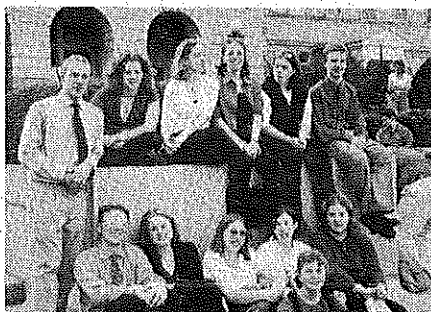
Oak Creek High School