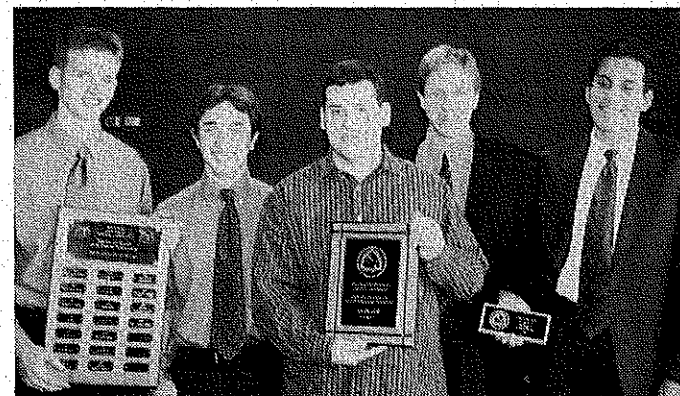
4-SPEAKER 1ST PLACE